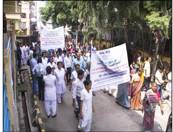
Staff and students in Rally