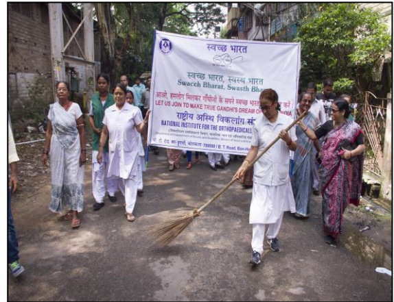
Cleaning by Nursing staff of NIOH