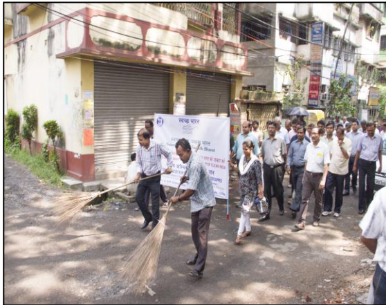
Cleaning on Road by NIOH Staff