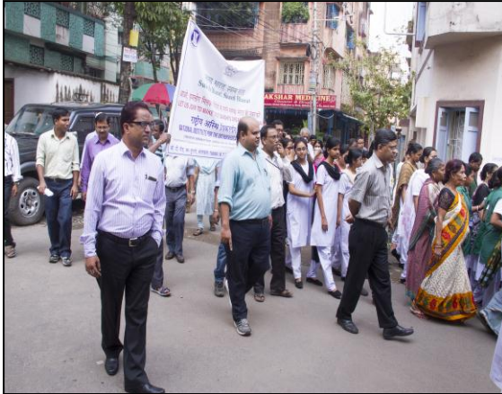
Director (o), DD(A) and AD(T) in Rally