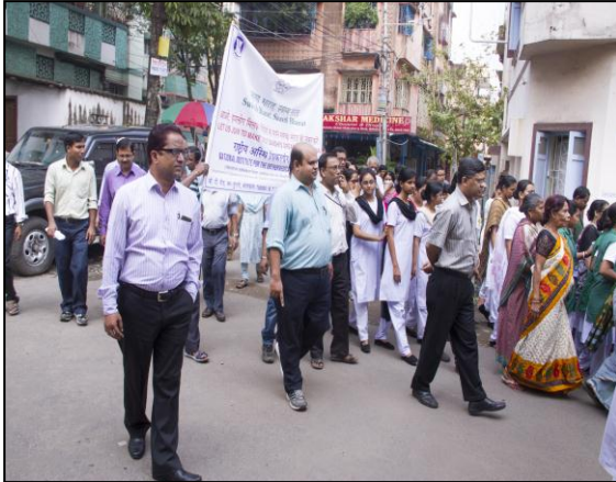
Director (o), DD(A) and AD(T) in Rally