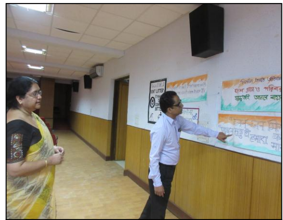
Reading slogans during the evaluation