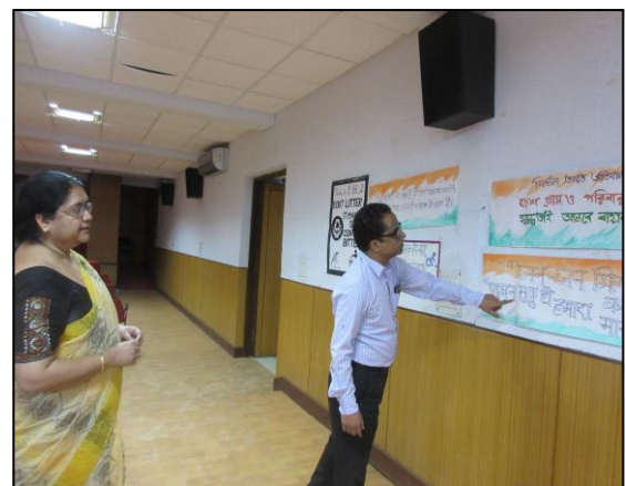
Reading slogans during the evaluation